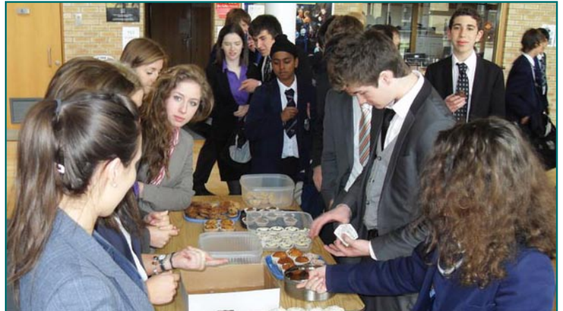
Queuing for goodies in aid of Malawi.

A bun sale in the theatre foyer raised more than £100 for Malawi...in just 20 minutes!